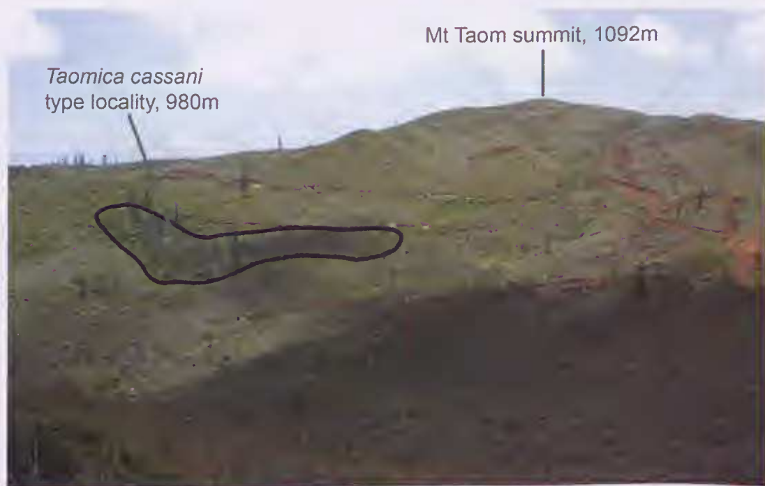
FIG. 3. Summit area of Mt Taom. The type locality of Taomica cassani is the small relict patch of rainforest indicated by the arrow. The absolute summit of the mountain is also indicated. The vehicle tracks visible are made by prospectors for nickel ore. The tall, dark trees are the native conifer, Araucaria montana .

foveae minuscule but well defined; antebasal sulcus absent; ventral pronotum (Fig. 2B) with anterior part covered with squamous setae, sides shiny with long, golden setae. Mesosternum small, anterior part with squamous setae, sides shiny with long, golden setae. Metasternum about 3 times as wide as long, lacking foveae, middle with shallow, oval depression; apex of metasternum broadly truncate.